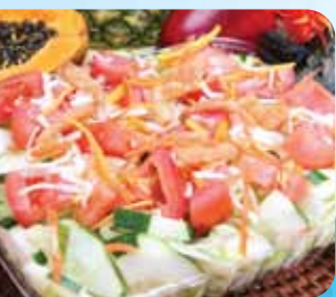
Island Caesar Salad