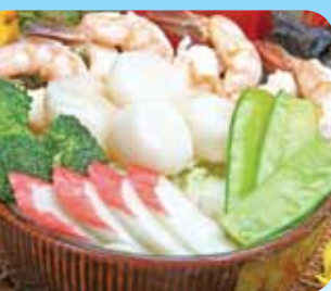
Seafood Noodle Soup